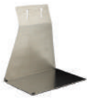
A813 Table Top Stand †