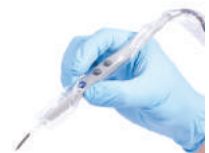
A910ST Sterile Handpiece Sheath †