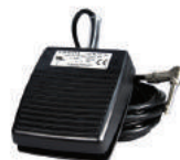
A803 Footswitch †

The Derm 102 has a bipolar mode going up to 10 watts