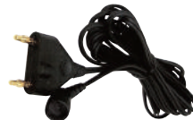
A827V Forcep Cable †